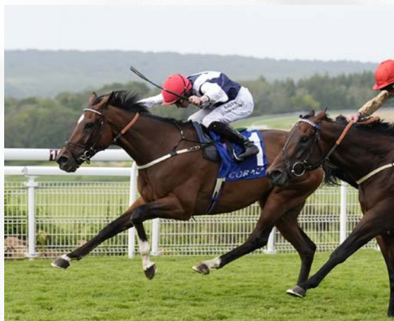
PARADIAS (Race 5) Winning at Goodwood