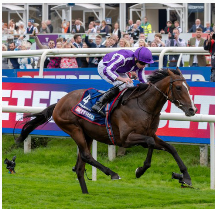
CONTINUOUS – 2023 WINNER

With regards to the market for the world's oldest Classic, first run in 1776, of the five such British races it has been the St Leger that has been by far the most consistent in terms of churning out successful favourites over the last three decades or so, having won 50% of the last 32 runnings.