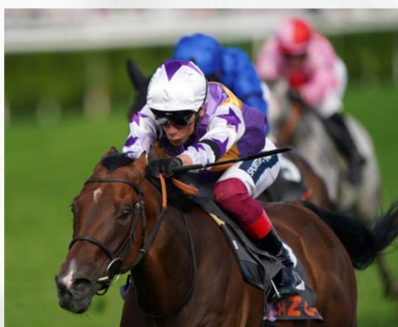
KINROSS Winning the 2022 Park Stakes