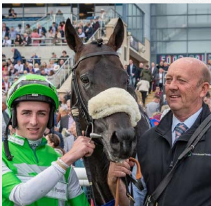
ANNAF – 2023 WINNER

This unusual distance of just over 5½f means that both 5f and 6f form play a part, and horses that have performed well in the Portland before often return to run big races once again.