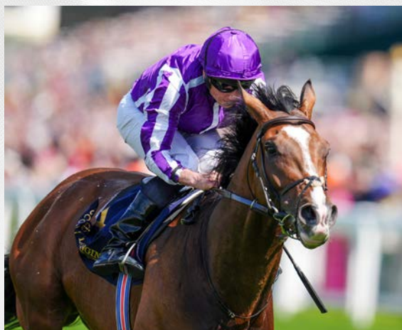
ILLINOIS Winning at Royal Ascot